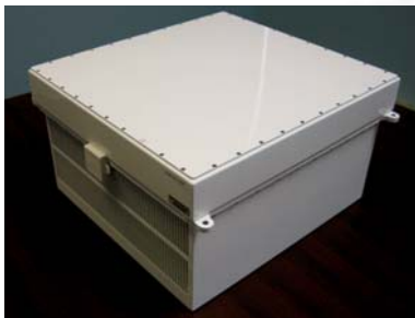
80 - 100W Ku-Band