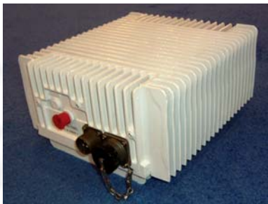
10 - 16W Ku-Band