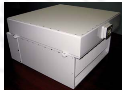
200 - 250W C-Band