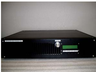
40 - 150W C-Band RM