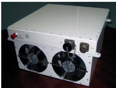
80 - 100W Ku-Band