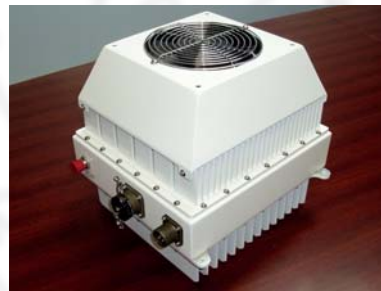
40 - 60W Ku-Band