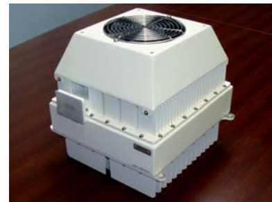
80 - 125W C-Band